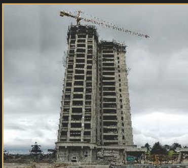
Oct 2019 - 22nd floor slab