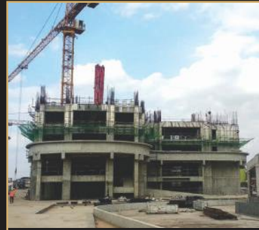
Nov 2018 - 4th floor slab