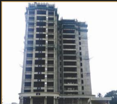
Jun 2019 - 16th floor slab