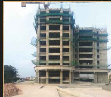
Feb 2019 - 10th floor slab