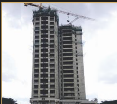
Sep 2019 - 20th floor slab