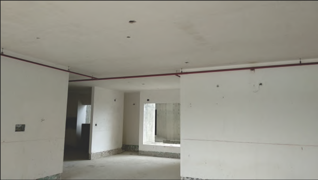
2nd to 3rd floor (Plastering work)