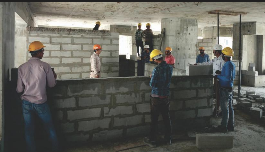
7th to 9th floor (Block work WIP)