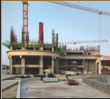
Oct 2018 - 3rd floor slab