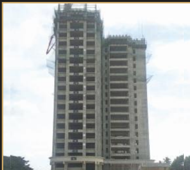
Jul 2019 - 18th floor slab