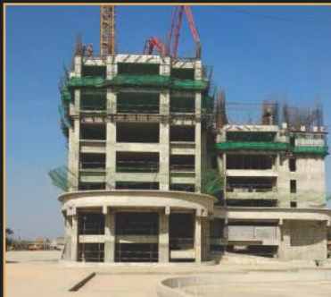
Jan 2019 - 7th floor slab