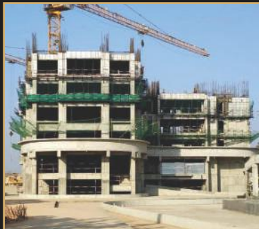
Dec 2018 - 6th floor slab