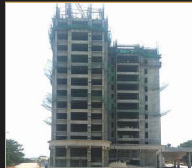
May 2019 - 13th floor slab