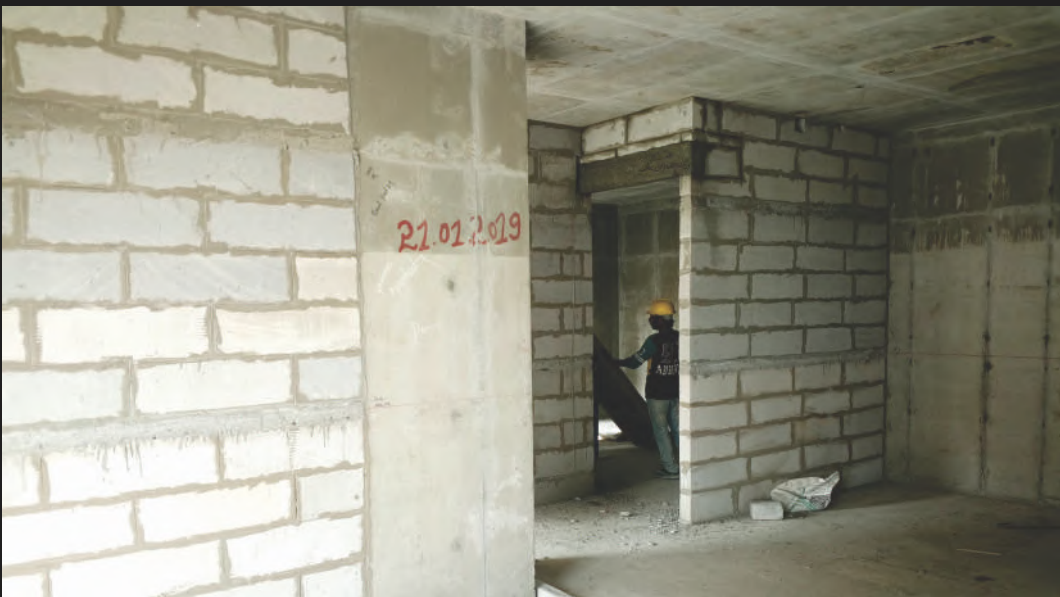
4th to 6th floor (Block work completed)