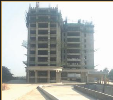
Mar 2019 - 11th floor slab