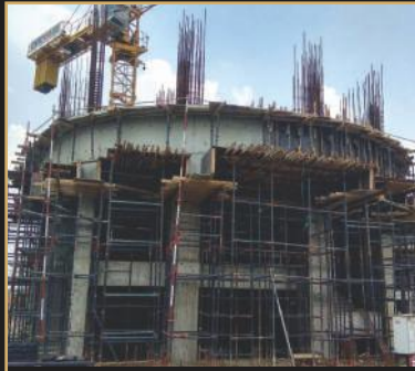
Sept 2018 - 2nd floor slab