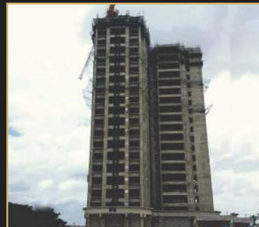
Aug 2019 - 20th floor slab