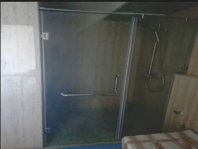
Shower partition fixing work completed