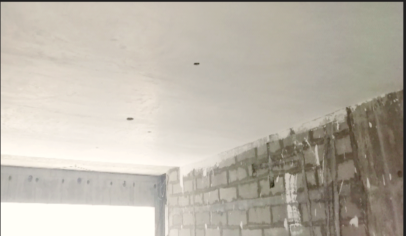
8th to 9th floor (Plastering work in Progress)