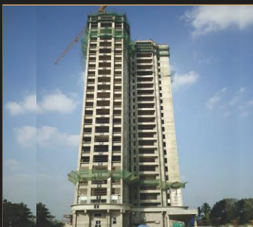
Dec 2019 - 25th floor slab