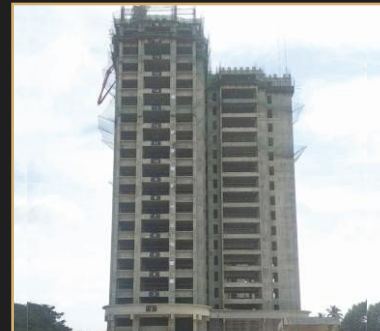
Jul 2019 - 18th floor slab