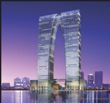
Gate of the Orient