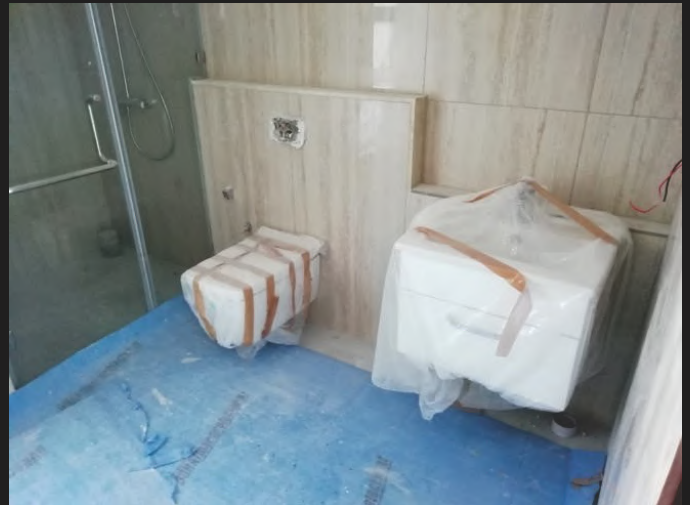
CP & Sanitary fixtures fixing work in progress