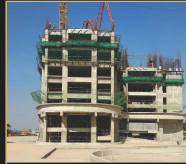
Jan 2019 - 7th floor slab