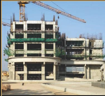
Dec 2018 - 6th floor slab