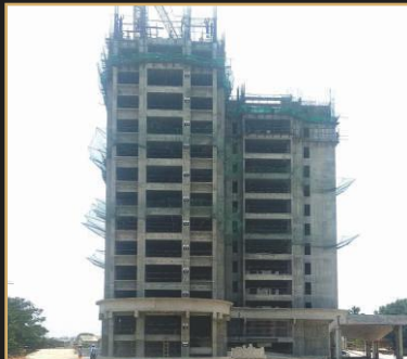
May 2019 - 13th floor slab