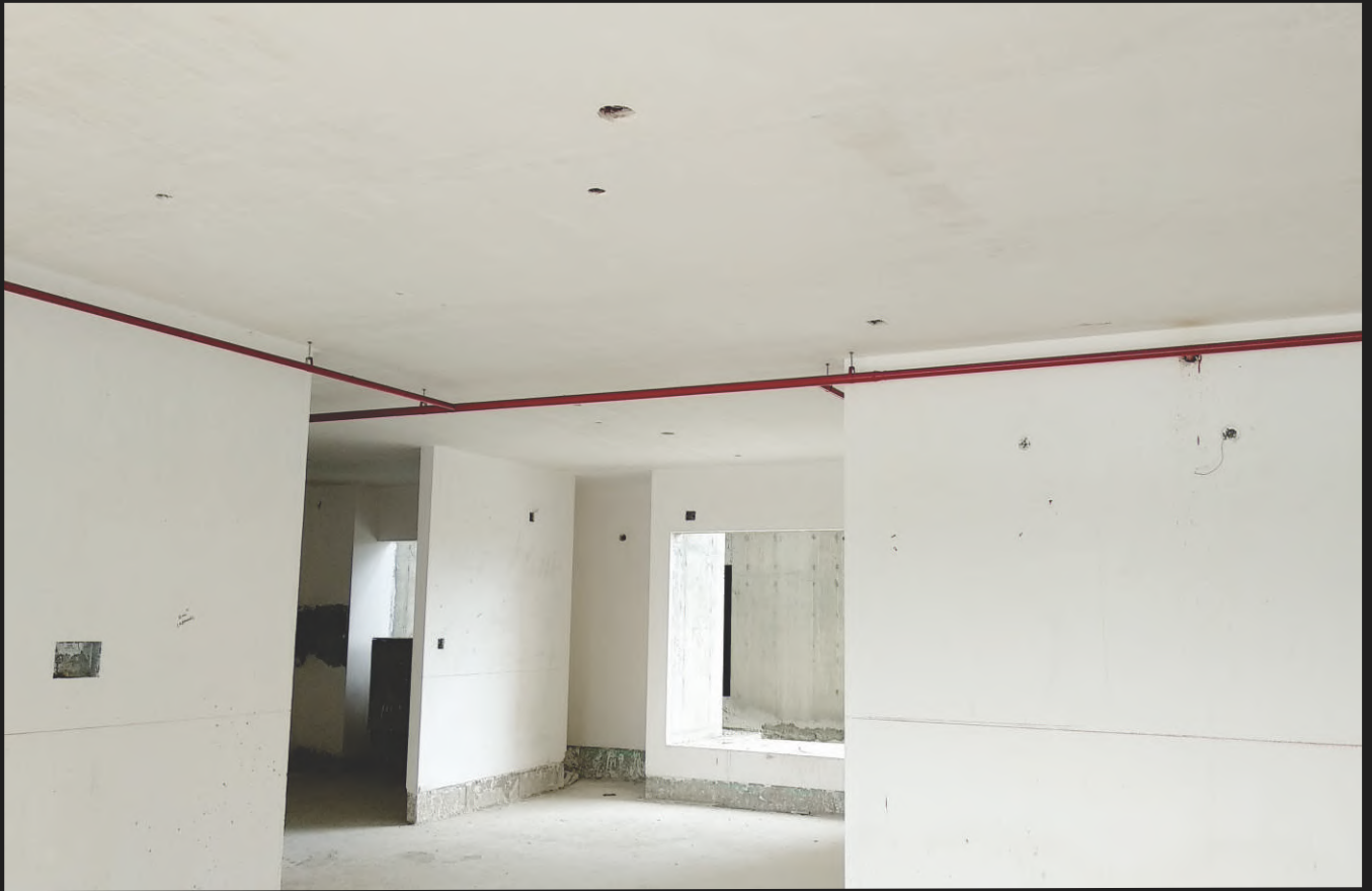
2nd to 7th floor (Plastering work completed)