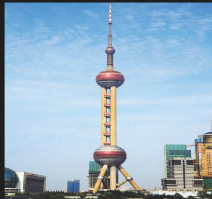
Oriental Pearl TV Tower