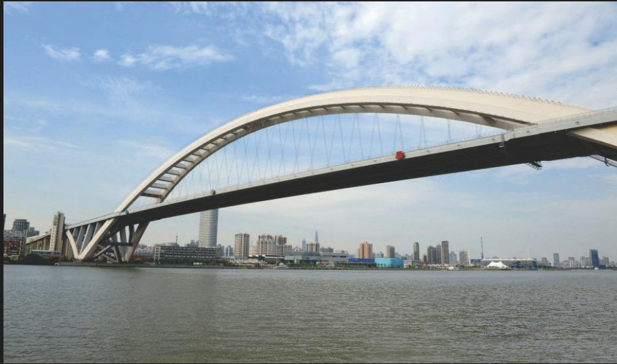
Shanghai Lupu Bridge

Across 6 Continents | Over 500 Projects Delivered | Reputed for Quality and on - time Delivery