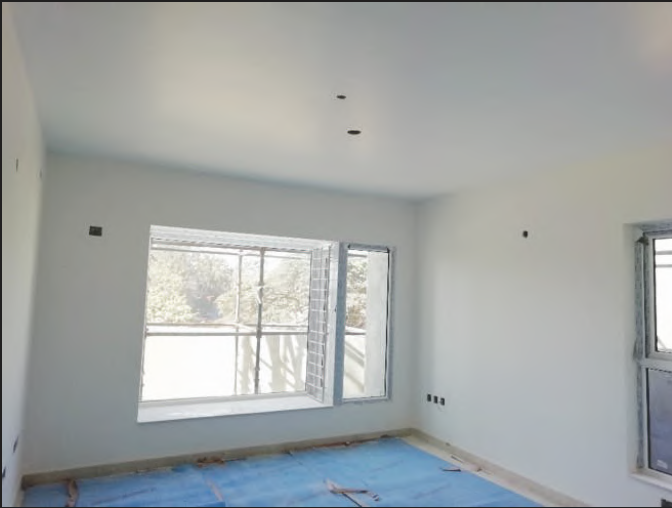
1st coat internal painting work in progress