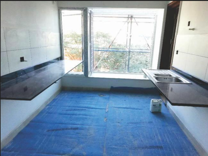
Kitchen counter slab fixing work completed