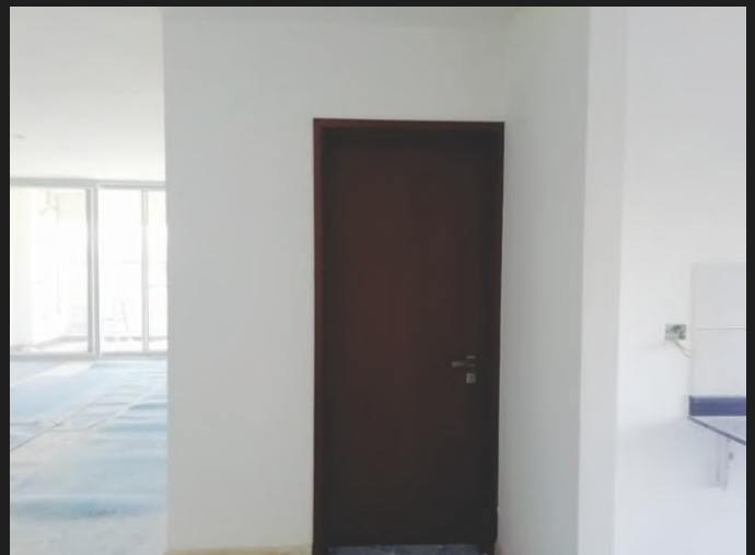
Door fixing & polishing work in progress