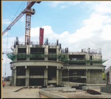
Nov 2018 - 4th floor slab