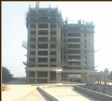
Mar 2019 - 11th floor slab