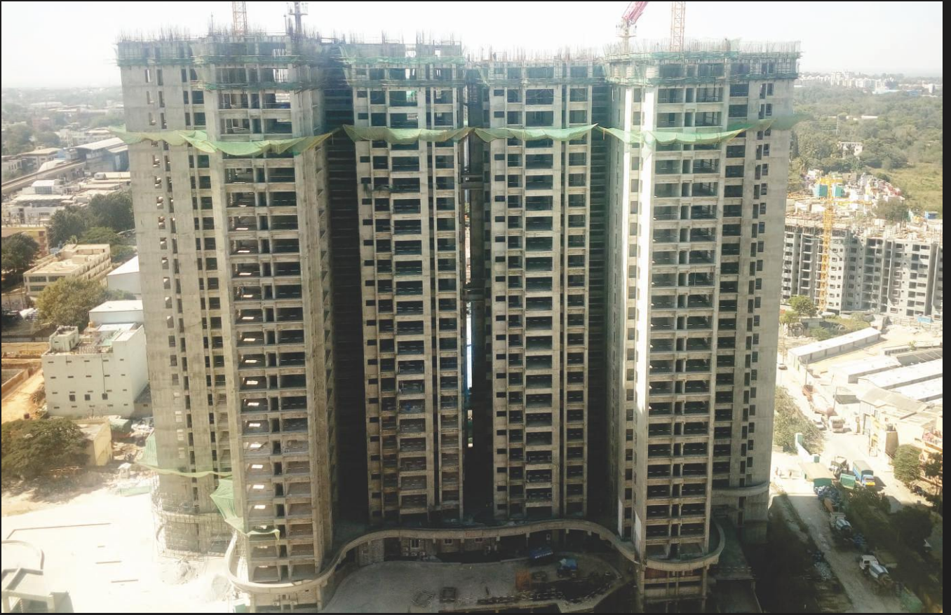
10. Side view