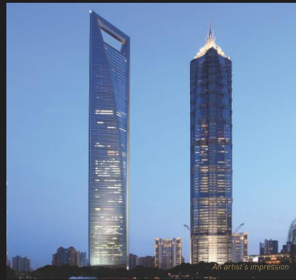
Shanghai World Financial Center Shanghai Jinmao Tower