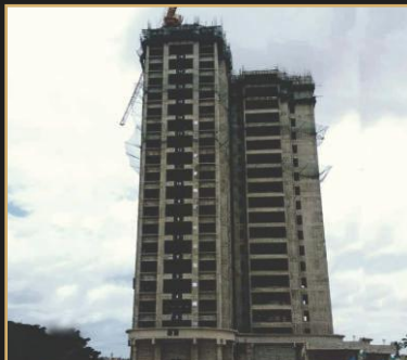
Aug 2019 - 20th floor slab