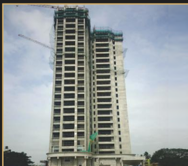
Nov 2019 - 24th floor slab