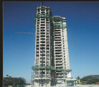
Jan 2020 - 26th floor slab