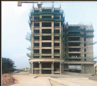
Feb 2019 - 10th floor slab