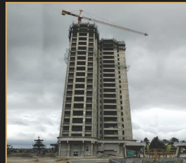
Oct 2019 - 22nd floor slab