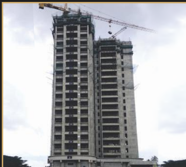
Sep 2019 - 20th floor slab