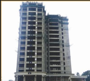
Jun 2019 - 16th floor slab