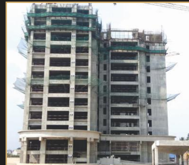
Apr 2019 - 12th floor slab