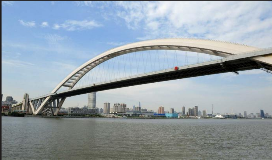
Shanghai Lupu Bridge

Across 6 Continents | Over 500 Projects Delivered | Reputed for Quality and on - time Delivery