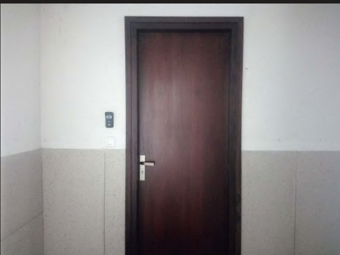
Door fixing & polishing work Completed