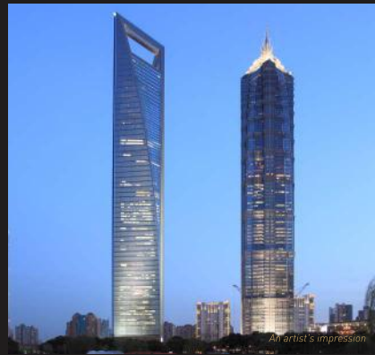
Shanghai World Financial Center Shanghai Jinmao Tower