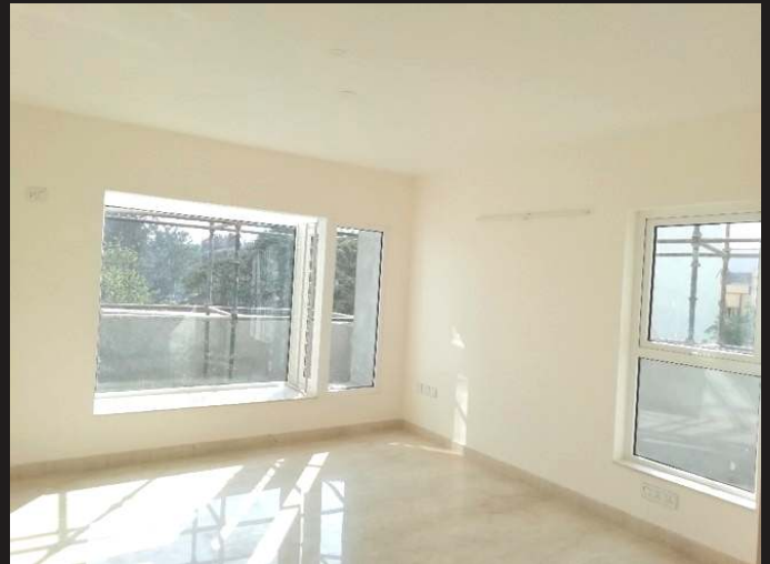
Final coat of painting Completed