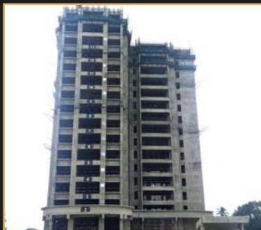
Jun 2019 - 16th floor slab