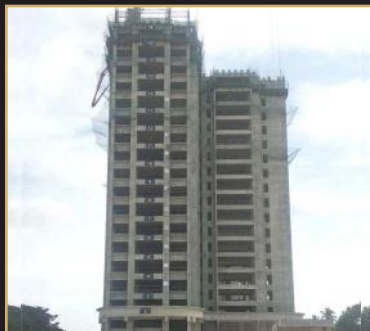
Jul 2019 - 18th floor slab