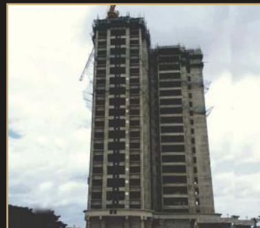
Aug 2019 - 20th floor slab