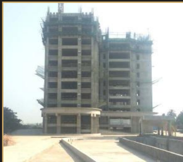
Mar 2019 - 11th floor slab