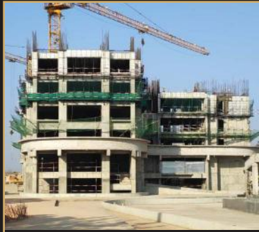
Dec 2018 - 6th floor slab