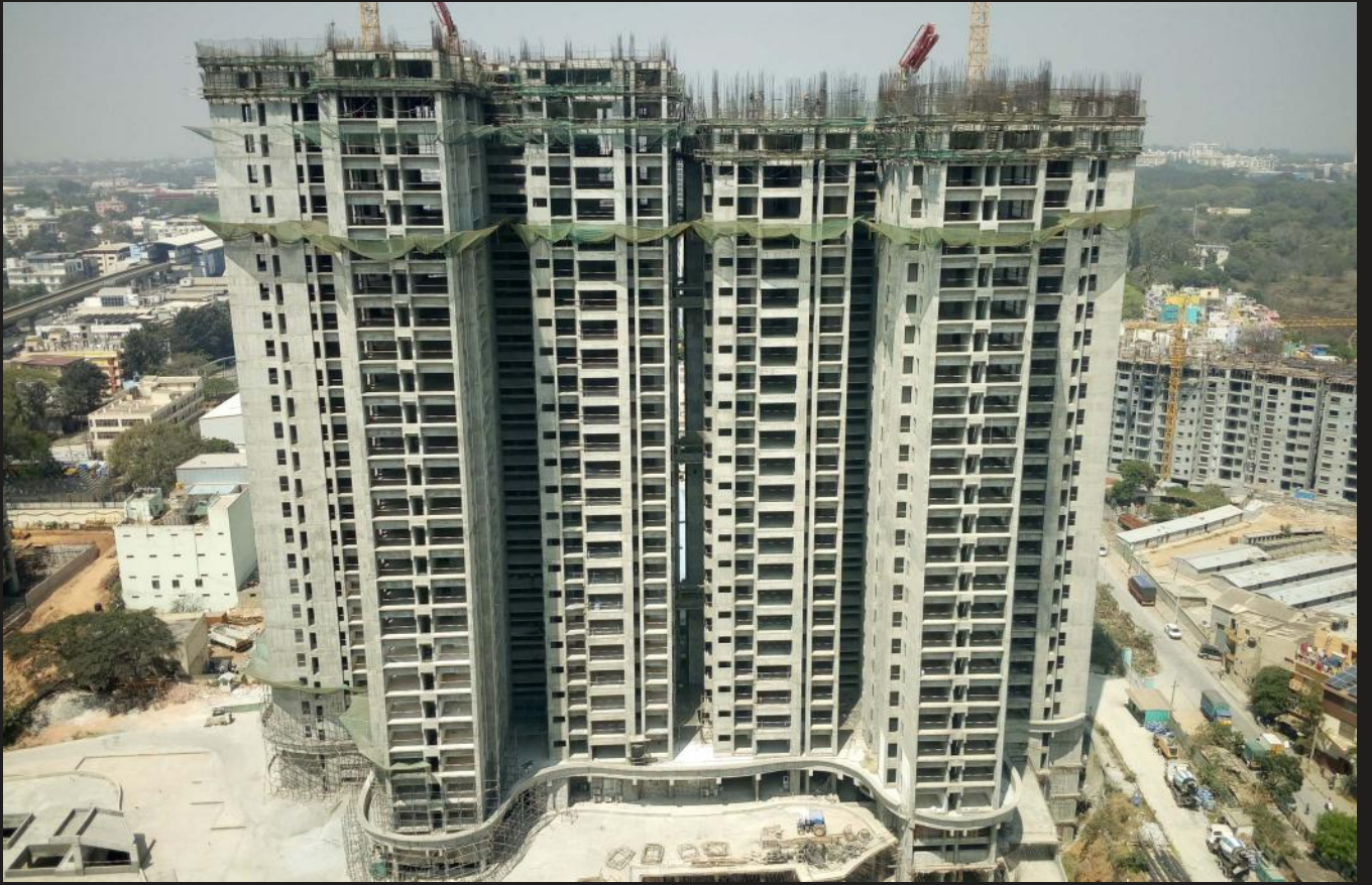
9. Side view