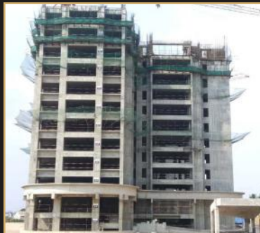
Apr 2019 - 12th floor slab