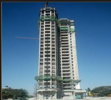
Jan 2020 - 26th floor slab