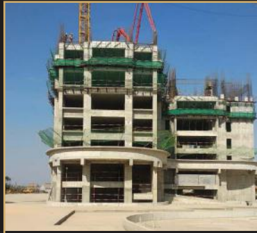
Jan 2019 - 7th floor slab