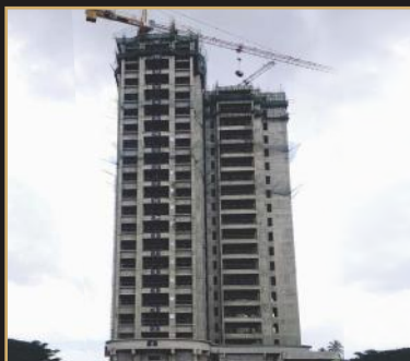
Sep 2019 - 20th floor slab