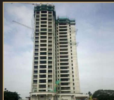
Nov 2019 - 24th floor slab