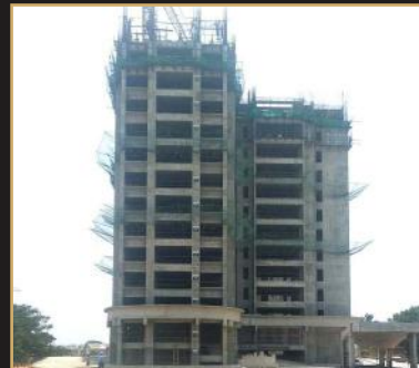
May 2019 - 13th floor slab