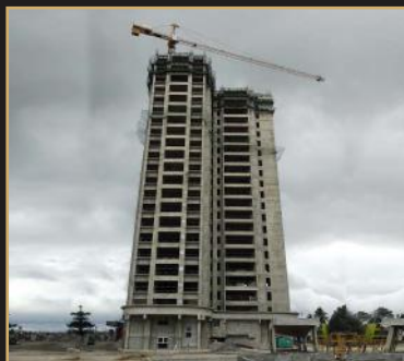
Oct 2019 - 22nd floor slab