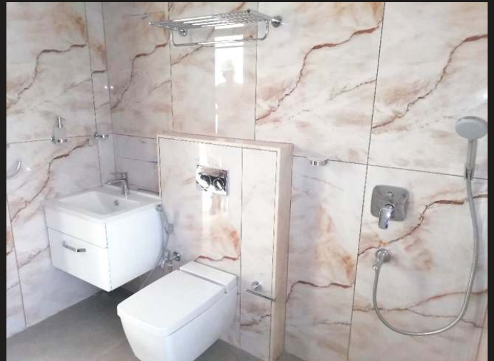
Shower partition fixing work completed