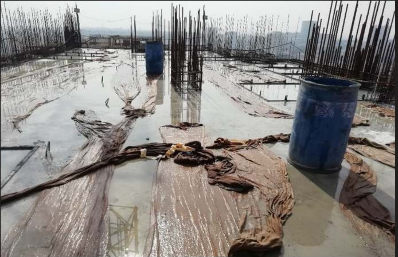
5. View of Block A