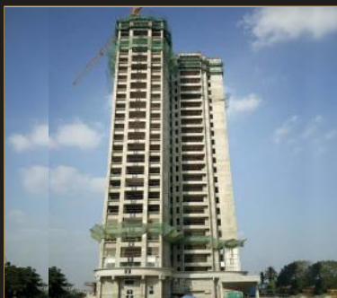
Dec 2019 - 25th floor slab