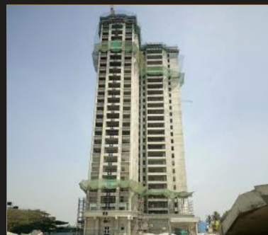
Feb 2020 - 27th floor slab