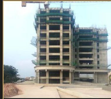
Feb 2019 - 10th floor slab