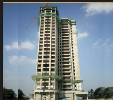
Dec 2019 - 25th floor slab