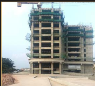
Feb 2019 - 10th floor slab