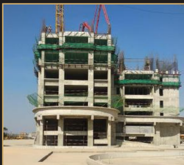
Jan 2019 - 7th floor slab