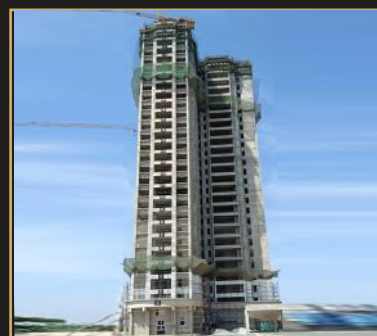
Mar 2020 - 28th floor slab