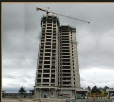
Oct 2019 - 22nd floor slab