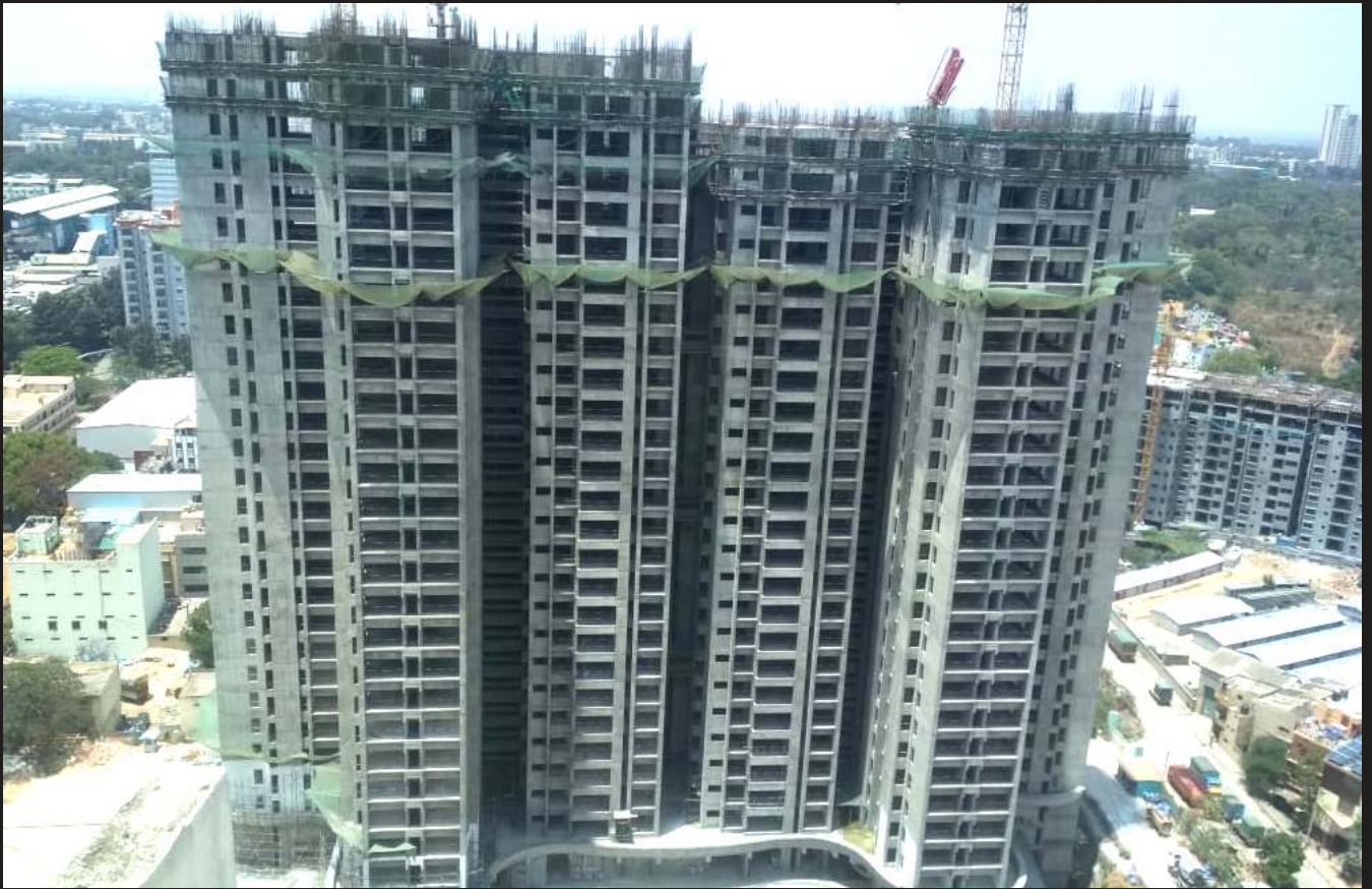
8. Side view