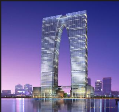
Gate of the Orient