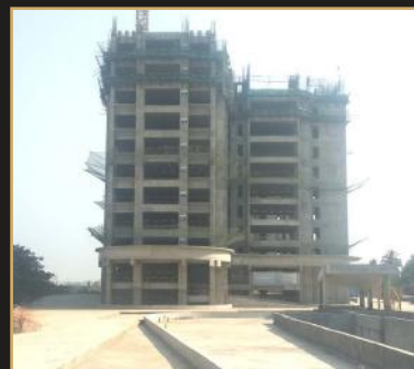
Mar 2019 - 11th floor slab