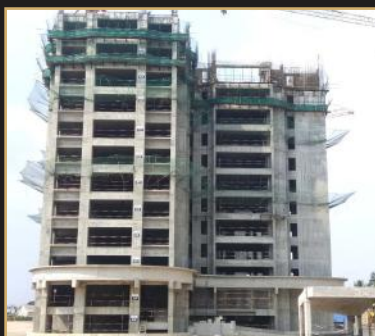
Apr 2019 - 12th floor slab