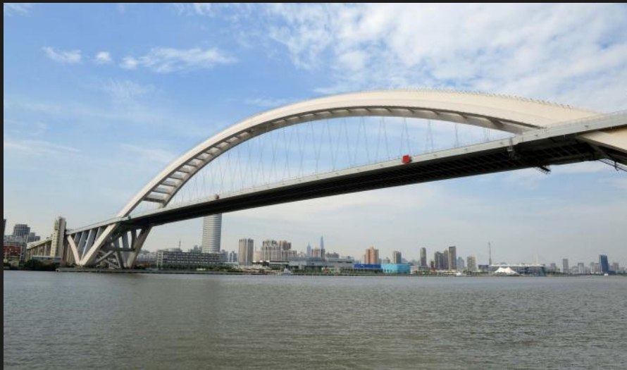
Shanghai Lupu Bridge

Across 6 Continents | Over 500 Projects Delivered | Reputed for Quality and on - time Delivery