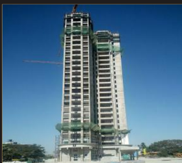
Jan 2020 - 26th floor slab