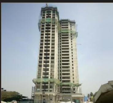
Feb 2020 - 27th floor slab