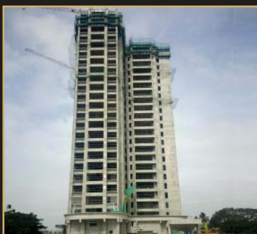
Nov 2019 - 24th floor slab