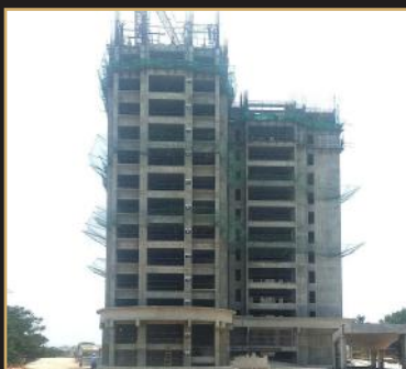
May 2019 - 13th floor slab