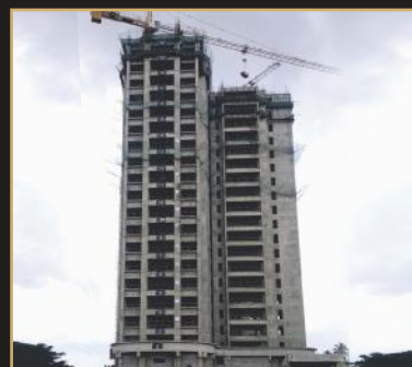
Sep 2019 - 20th floor slab