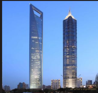
Shanghai World Financial Center Shanghai Jinmao Tower