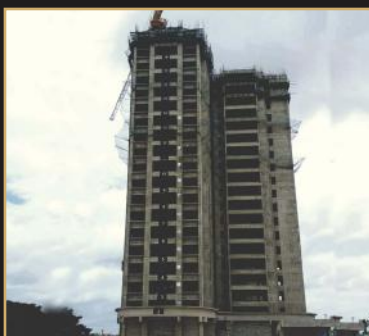
Aug 2019 - 20th floor slab