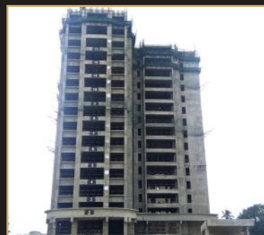
Jun 2019 - 16th floor slab