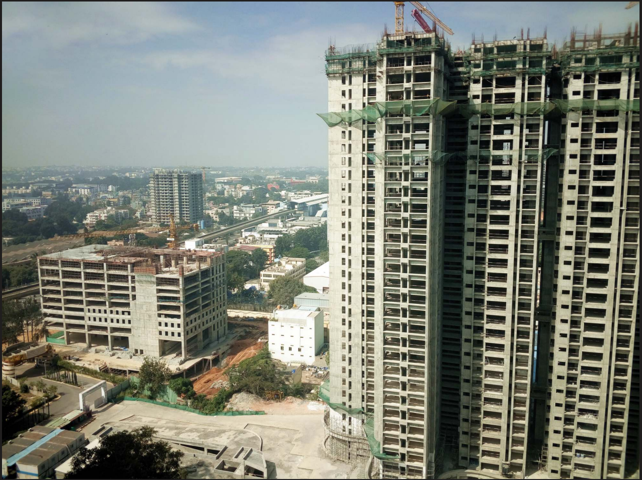
5. View of Block B