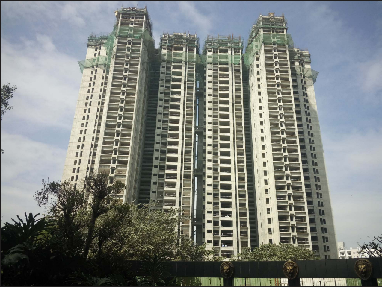
3. Side View