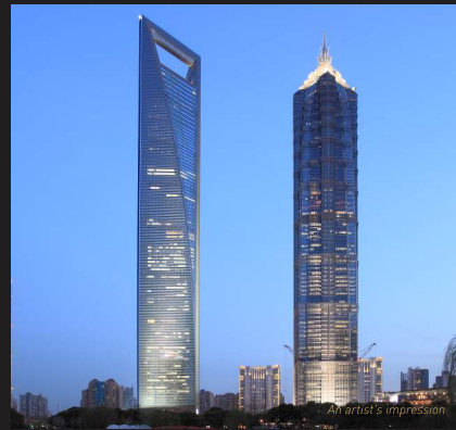
Shanghai World Financial Center Shanghai Jinmao Tower