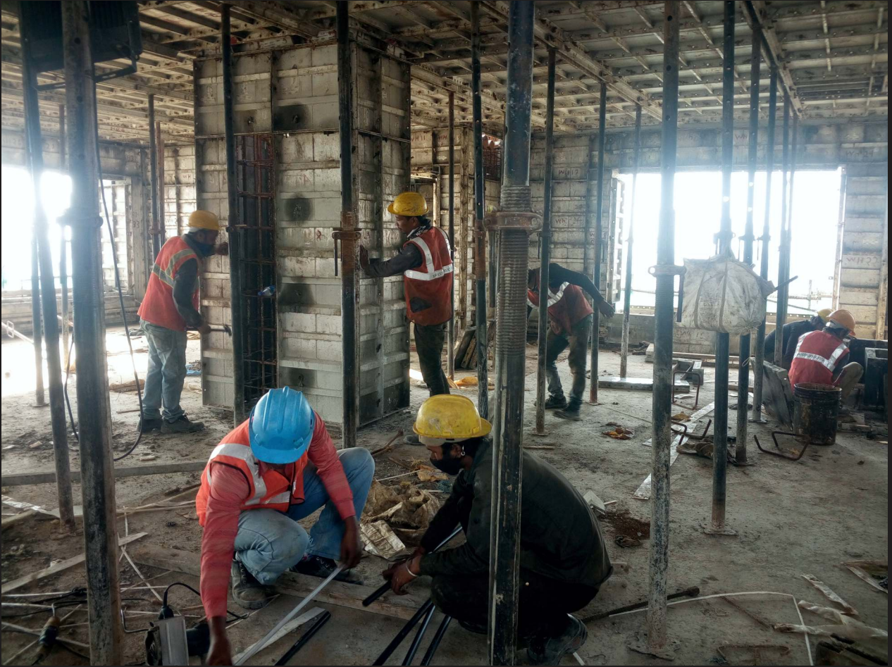
7. 32nd floor concreting work in progress on Tower B