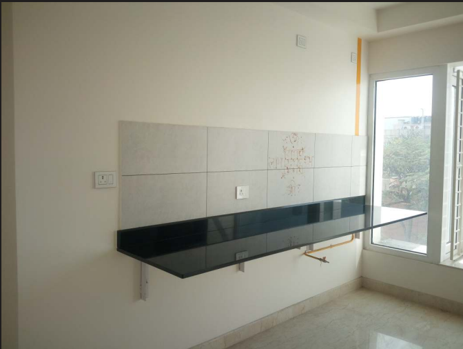
Kitchen counter slab fixing work completed