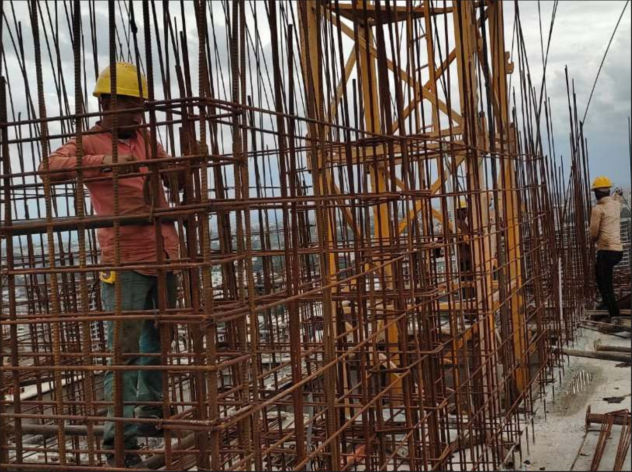
9. Tower A 34th floor shuttering works