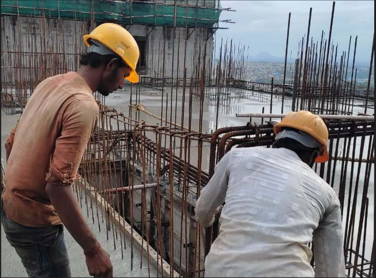
11. 34th floor slab concrete completed B1 & B2 on Tower B