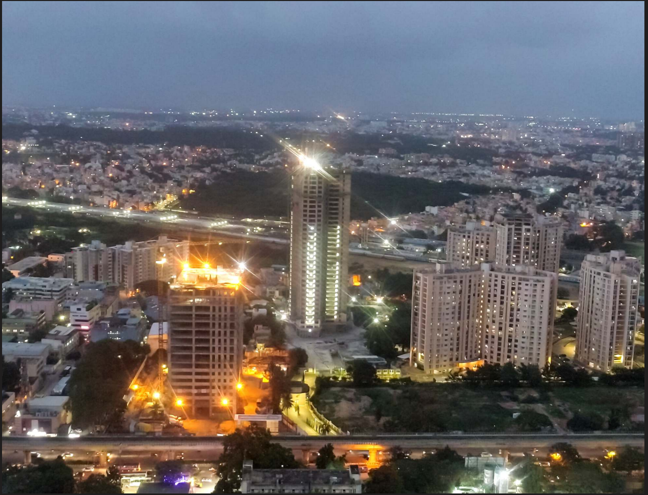
13. Evening side view of Block A