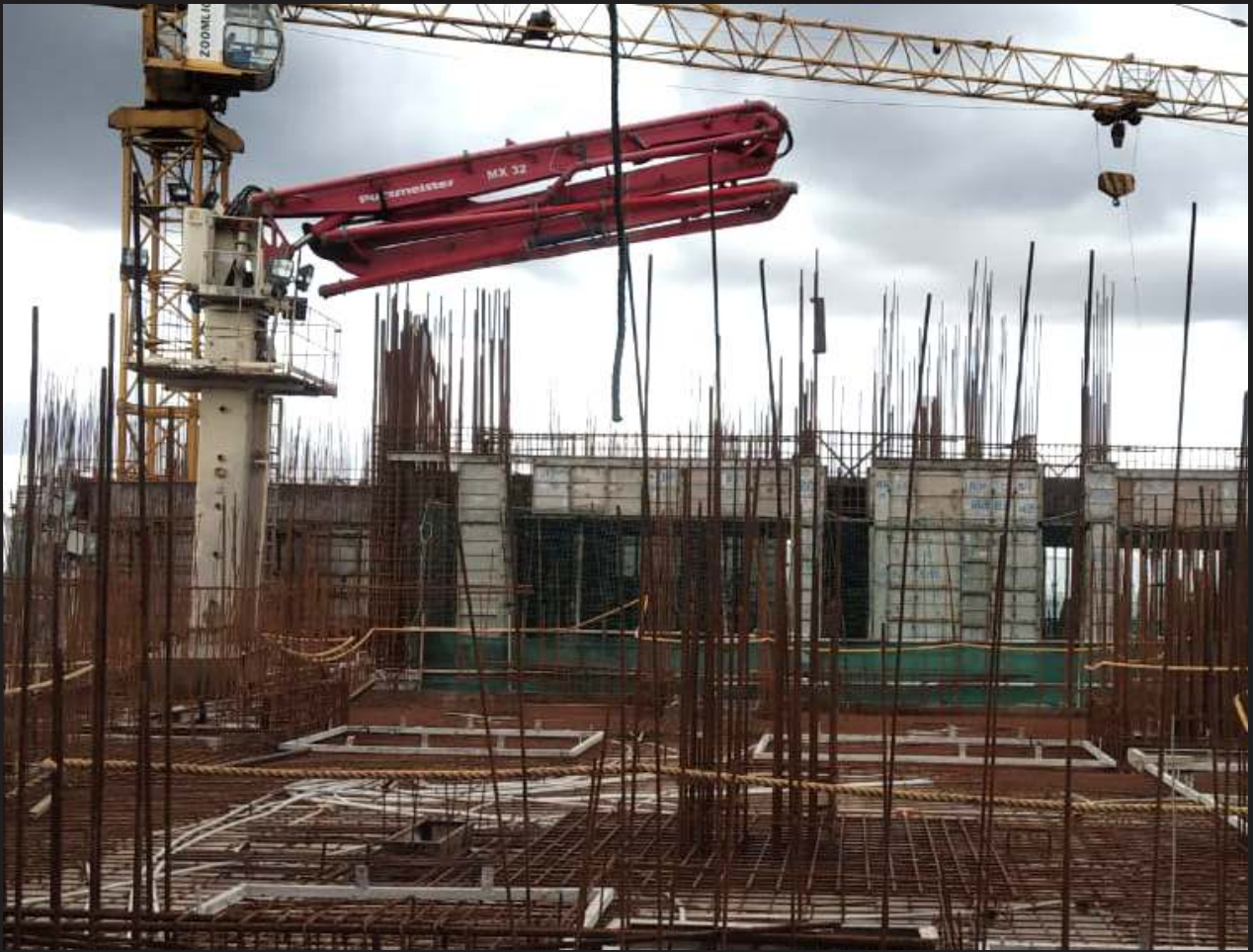
9. 35th floor B1, B2 shattering work progress on tower B