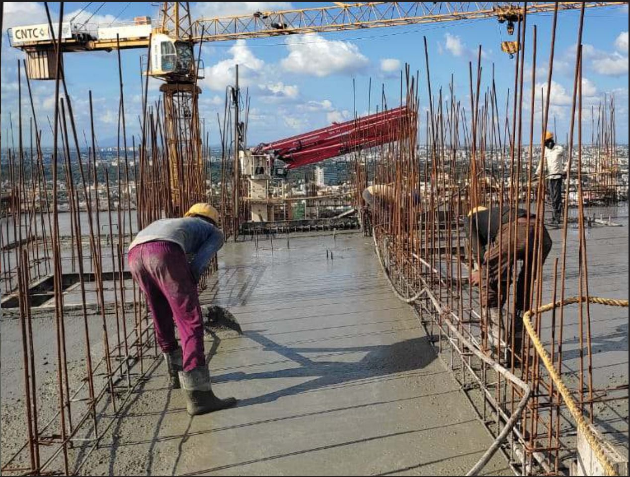
7. 37th floor Rebar structure progress on Tower A