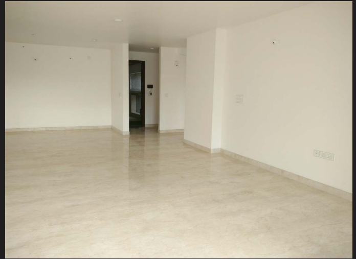
Final coat of painting Completed