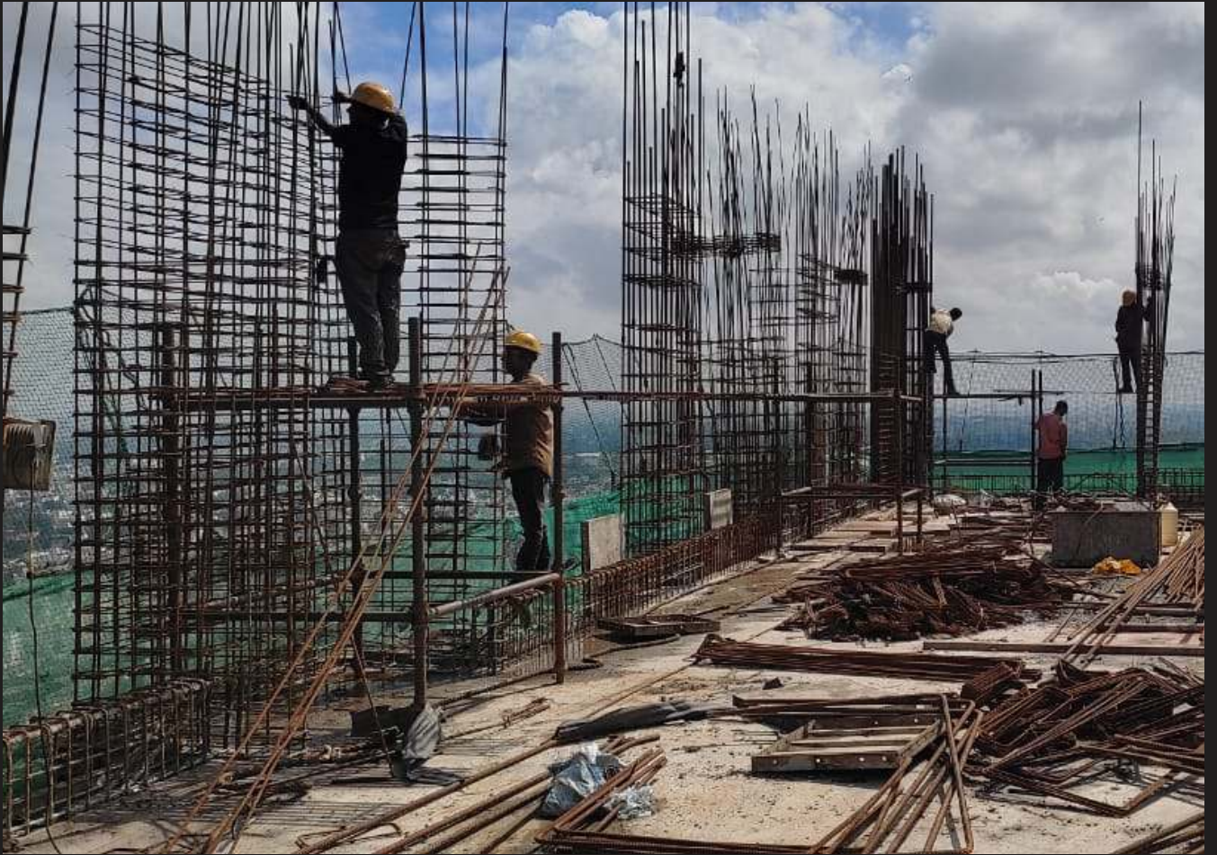
11. 36th floor shuttering work progress on Tower B