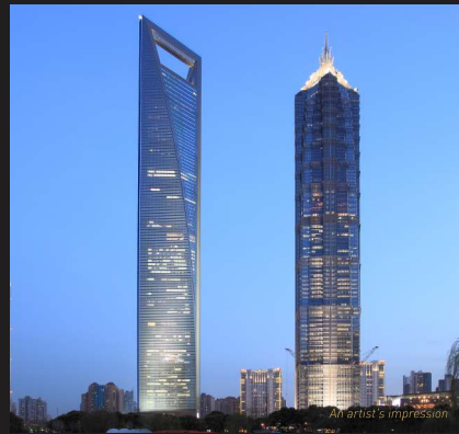
Shanghai World Financial Center Shanghai Jinmao Tower