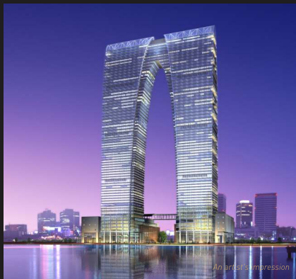
Gate of the Orient