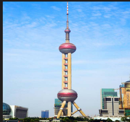
Oriental Pearl TV Tower