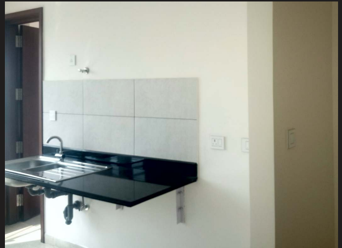
Kitchen counter slab fixing work completed