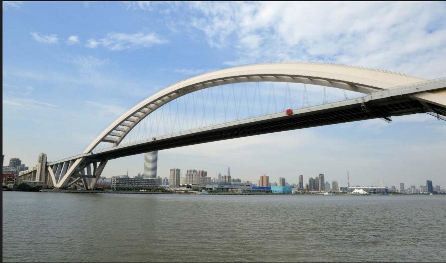
Shanghai Lupu Bridge

Across 6 Continents | Over 500 Projects Delivered | Reputed for Quality and on - time Delivery