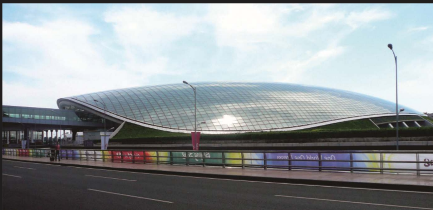
T3 Terminal of Beijing Capital International Airport