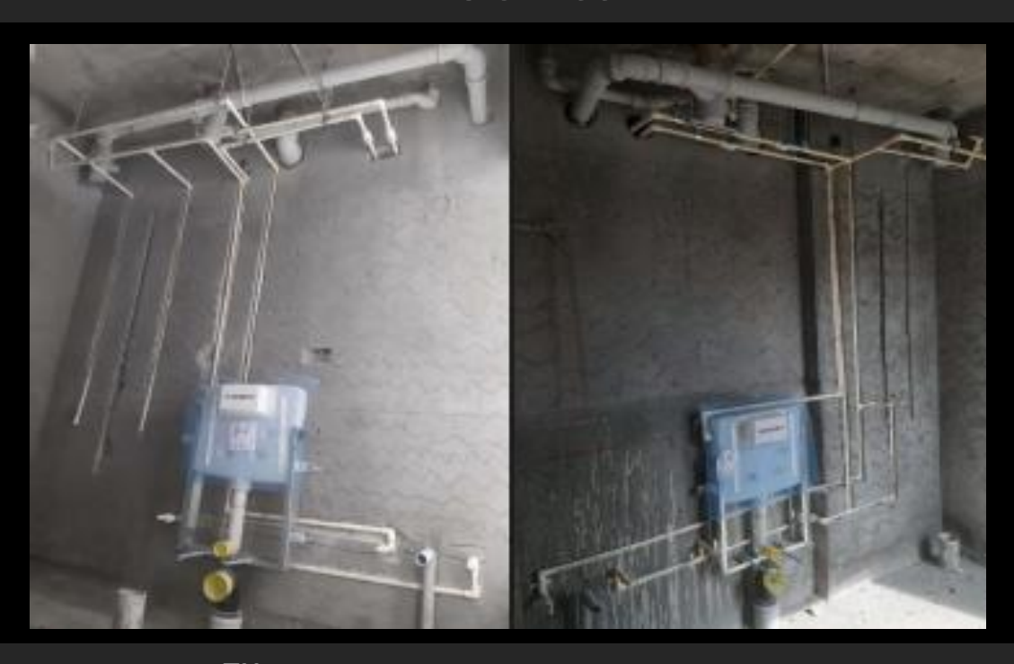
TOWER B – 36<sup>TH</sup> FLOOR PLUMBING WORK IN PROGRESS