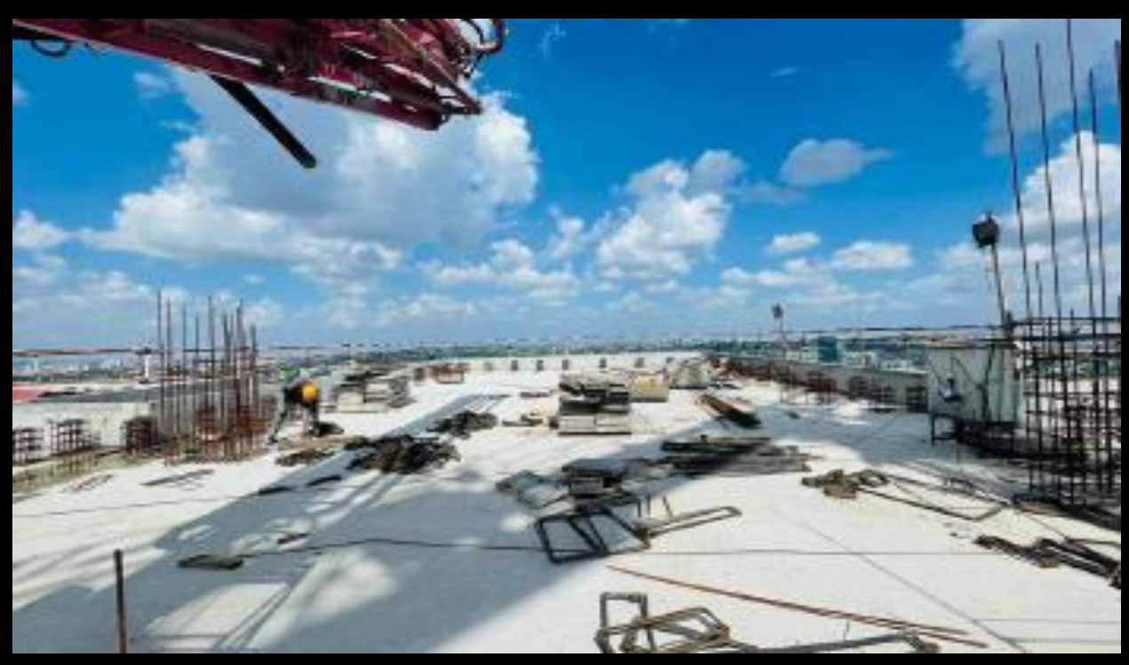
TOWER A: 50<sup>TH</sup> FLOOR A1 & A2 CONCRETE WORK COMPLETED