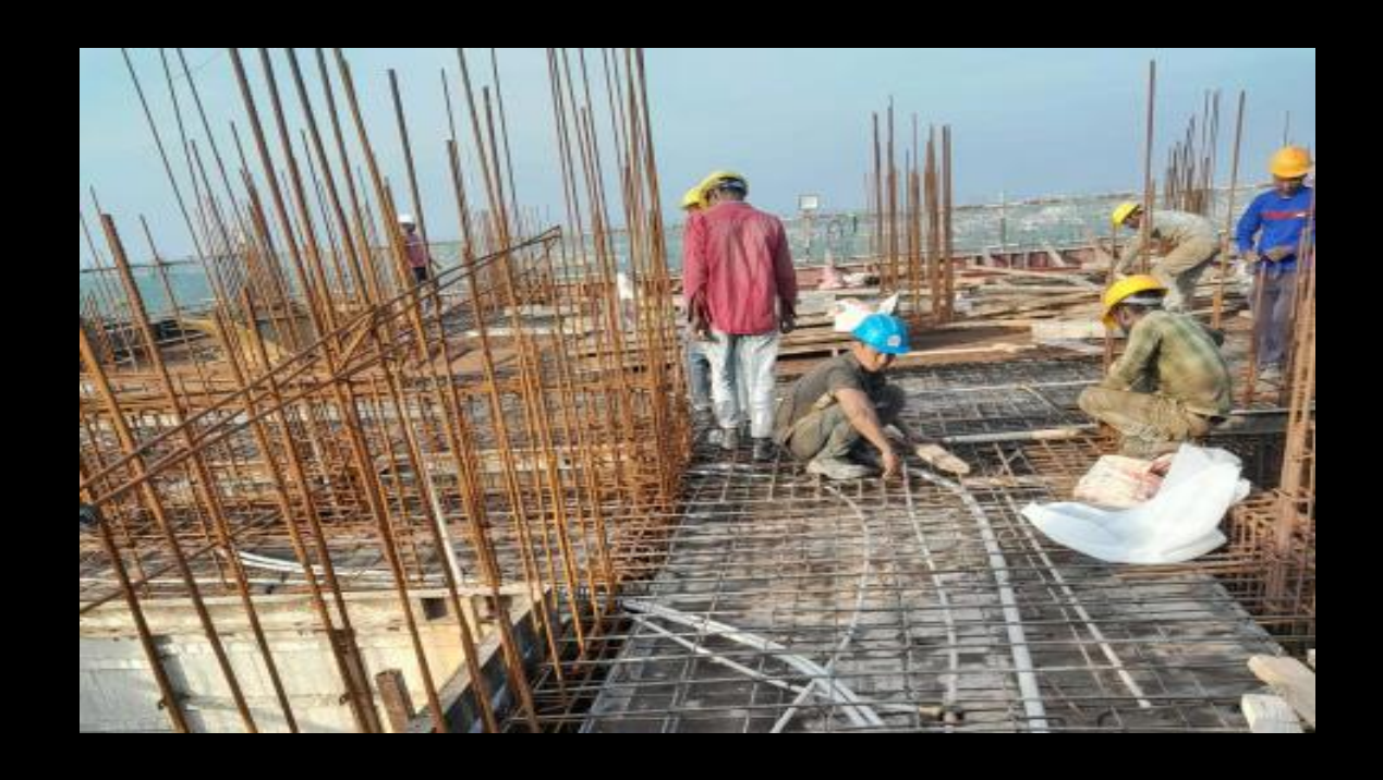
TOWER B: 48<sup>TH</sup> FLOOR B1 ELECTRICAL CONDUIT WORK COMPLETED